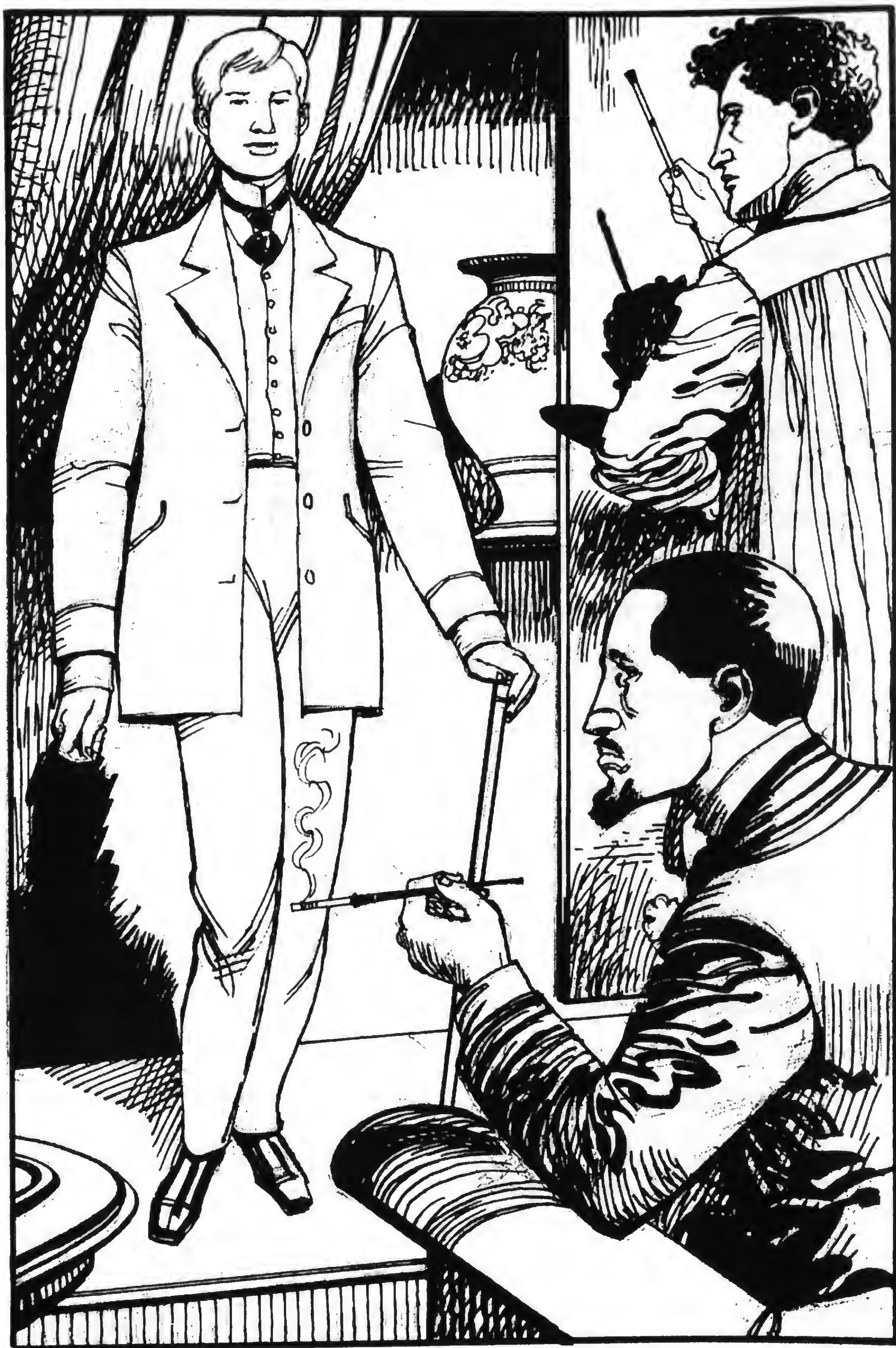
Lord Henry watched him. He knew the exact moment when to say nothing.

touched his soul. Yes, there had been things in his boyhood that he had not understood. He understood them now.